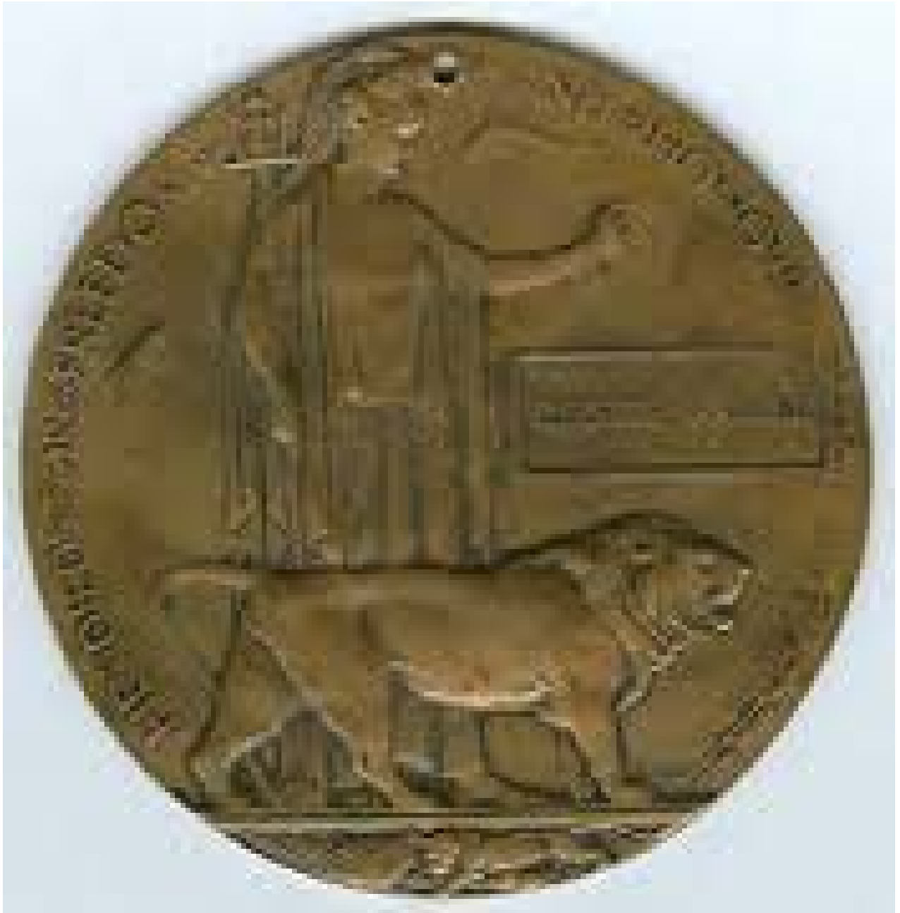
The bronze memorial plaque “dead man’s penny” awarded to the next-of-kin of Private Jonathon BLACKHURST