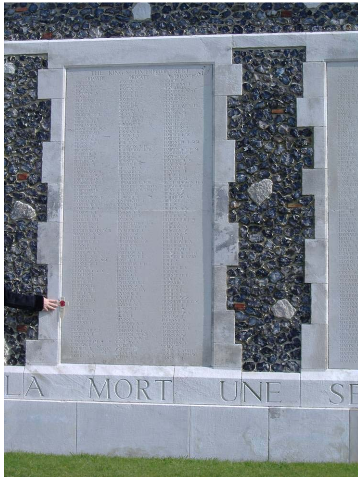
Photographs of COOKE's memorial at Tynecot Cemetery, Passchendaele Panel No. 32