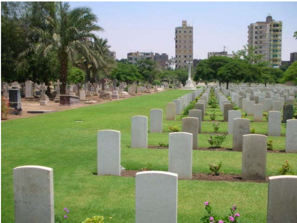
General views of Cairo war cemetery