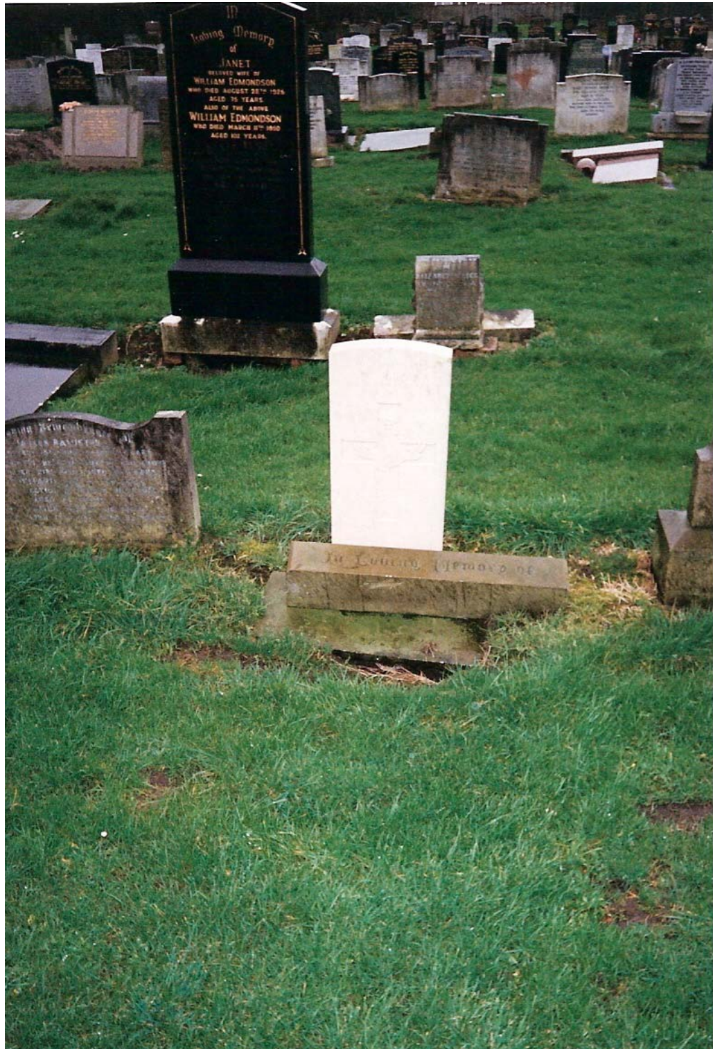
2 nd Lieut. GIBSON's grave at Longton Church, no. 360