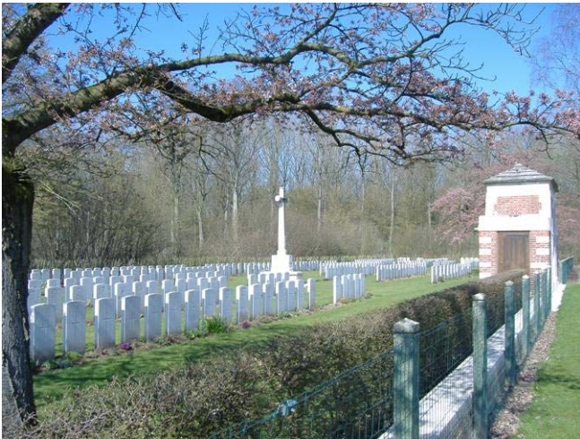
General view of Aval Wood Cemetery