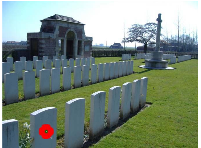
The grave in relation to the entrance