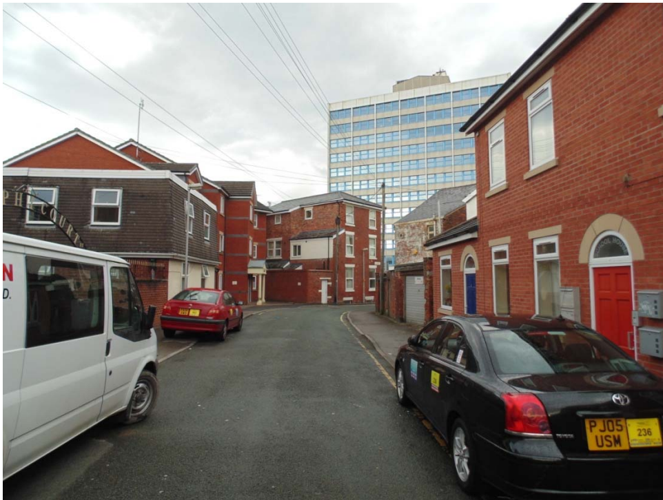
Adelphi Place, Preston, 2015, opposite the B.T. office tower on Moor Lane.