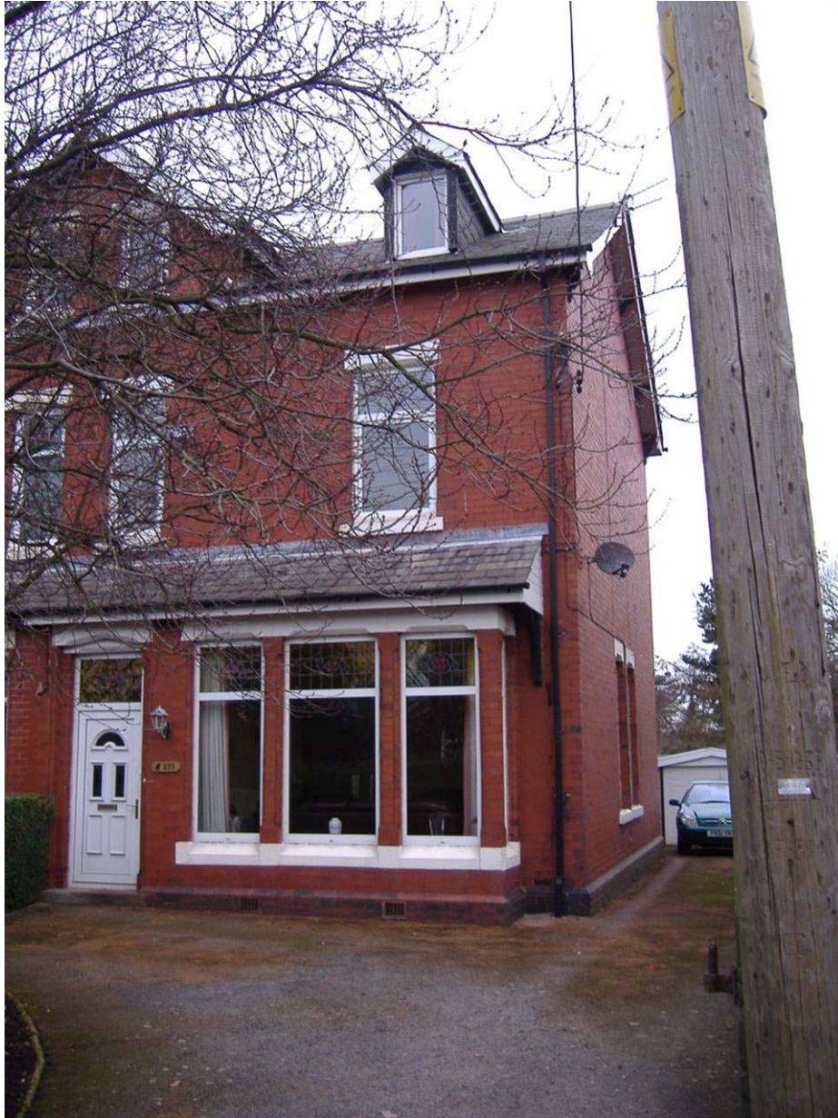
The HOWORTH family home at “Windsor”, 335, Chapel Lane, New Longton (See also RIGBY)