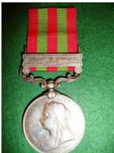
Medal awarded to troops engaged in the relief of Chitral Fort