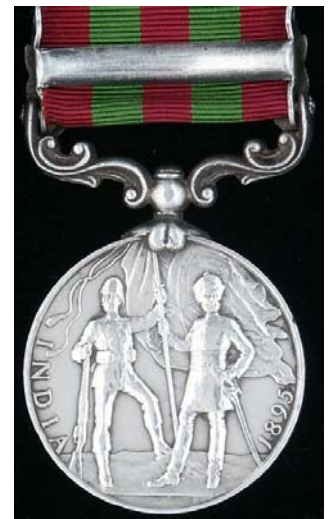
Punjab and Tirah 1897-8 Medal