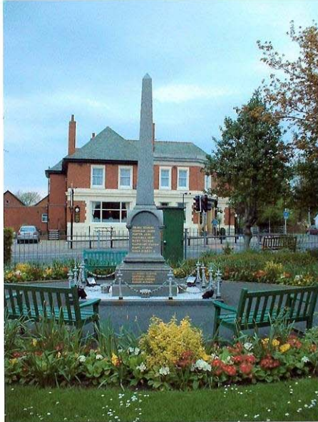
The 1914 – 1918 War Memorial at Freckleton, Lancashire.