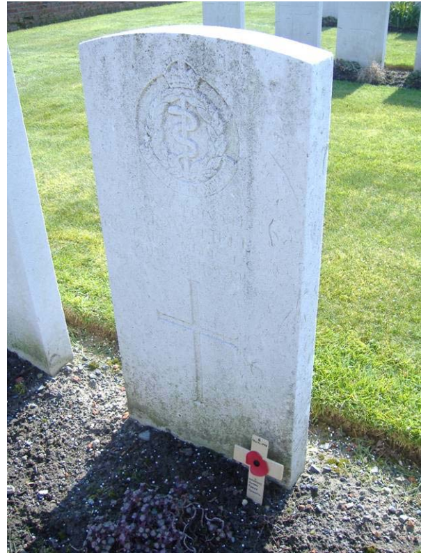
Close-up of Private RAWCLIFFE's headstone at I. H. 5.