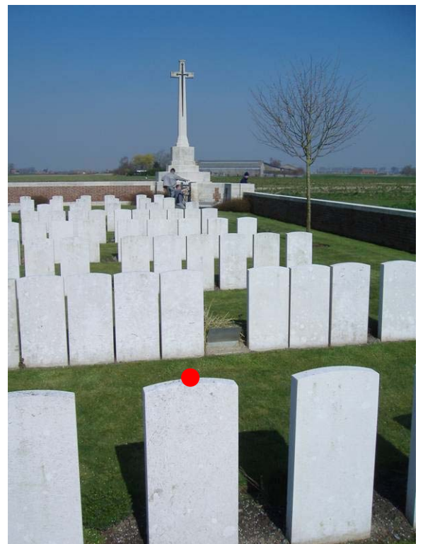
Private Rawcliffe's grave highlighted in relation to the Great Cross.