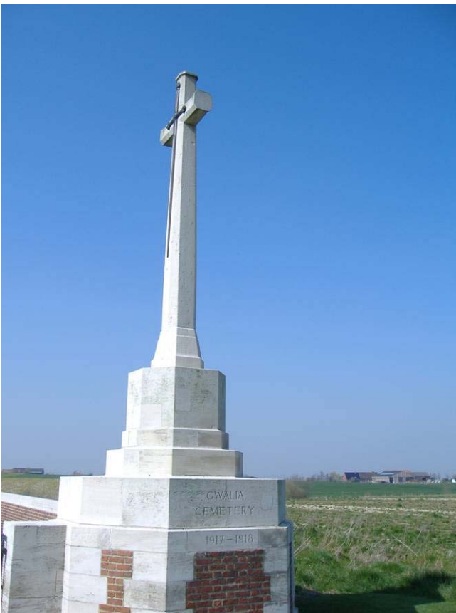
The Great Cross at Gwalia Cemetery