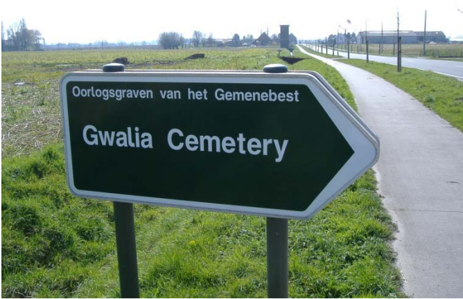
Commonwealth War Graves Commission signpost.